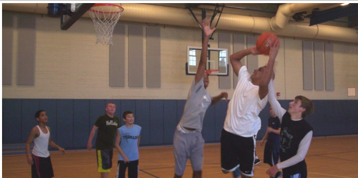
HMS basketball team hopefuls practice at open gym held this fall at the Castle.